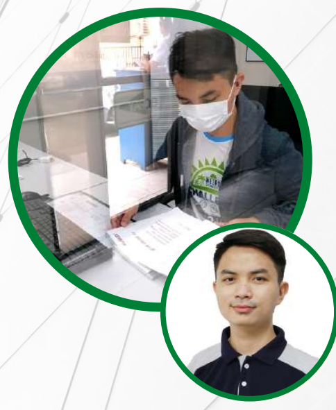
Trust in the Lord with all your heart and lean not on your own understanding; in all your ways submit to him, and he will make your paths straight. Proverbs 3:5-6