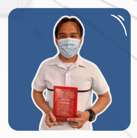
Nerfe Musni Deposit Ruby Awardee (Deposit Referral: P1,041,600.00)