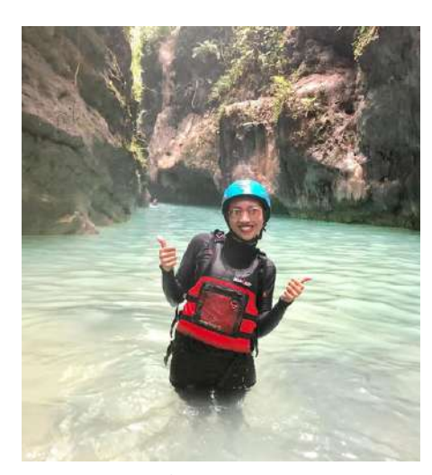
Canyoneering at Kawasan Falls, Cebu

Beach babe? If you're a fan of white sand beach w/ beautiful stone formation. Palawan is for anyone who wants to enjoy this kind of relaxation and surely you'll get tanned! ©