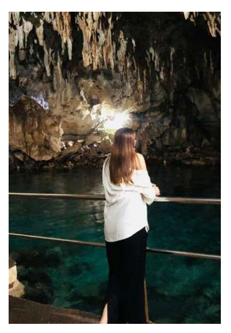
Underground Cave, Bohol

Adventure awaits you in Kawasan Falls, a kick of adrenaline will rush in your veins. Best to try w/your group of friends!